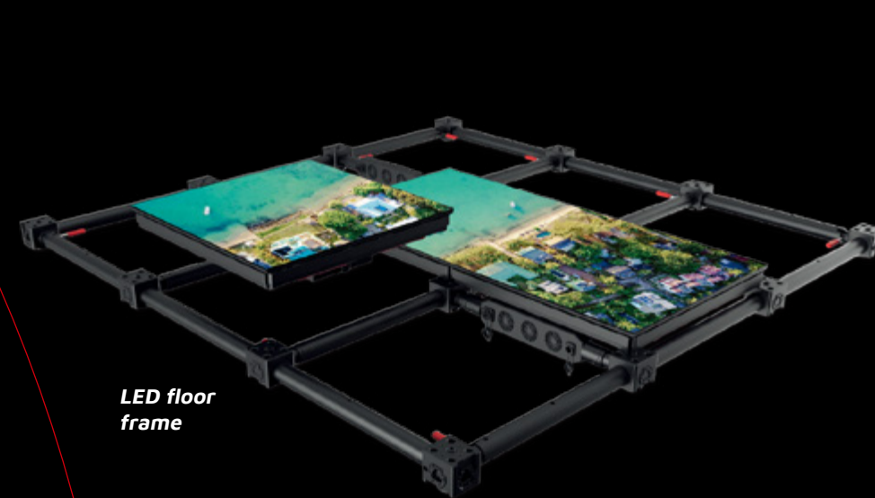
LED floor frame