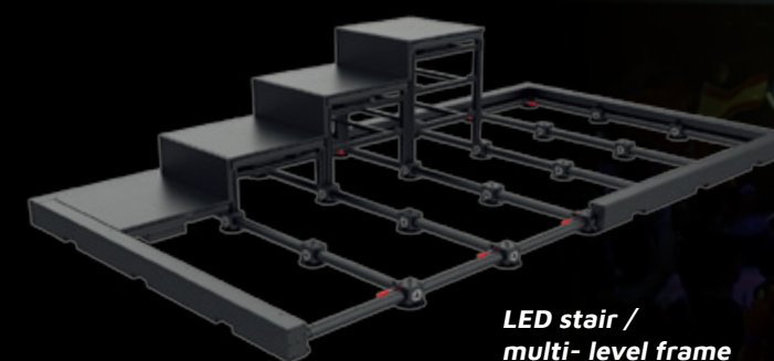
LED stair / multi-level frame